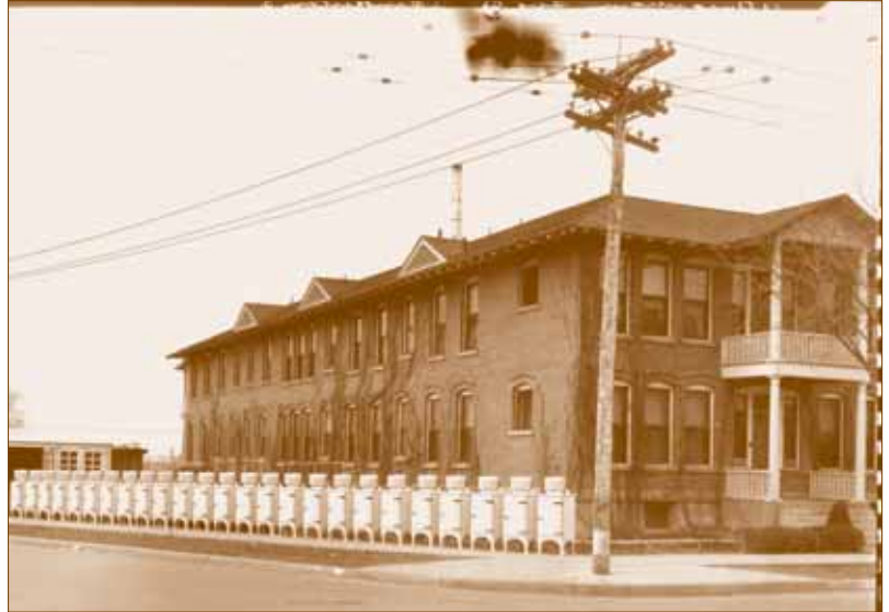
Refrigerators along 10th at the Washington Apartments, 1940.

In the 1990s, the Raynolds Neighborhood Association began painting murals, planting xeric gardens, and sculpting dead elm trees on residential properties. The association helped redesign Washington Park and designed and built a neighborhood entrance at Park and 10th streets. Projects were done in collaboration with Washington Middle School students, the City, and Rowlands nursery.