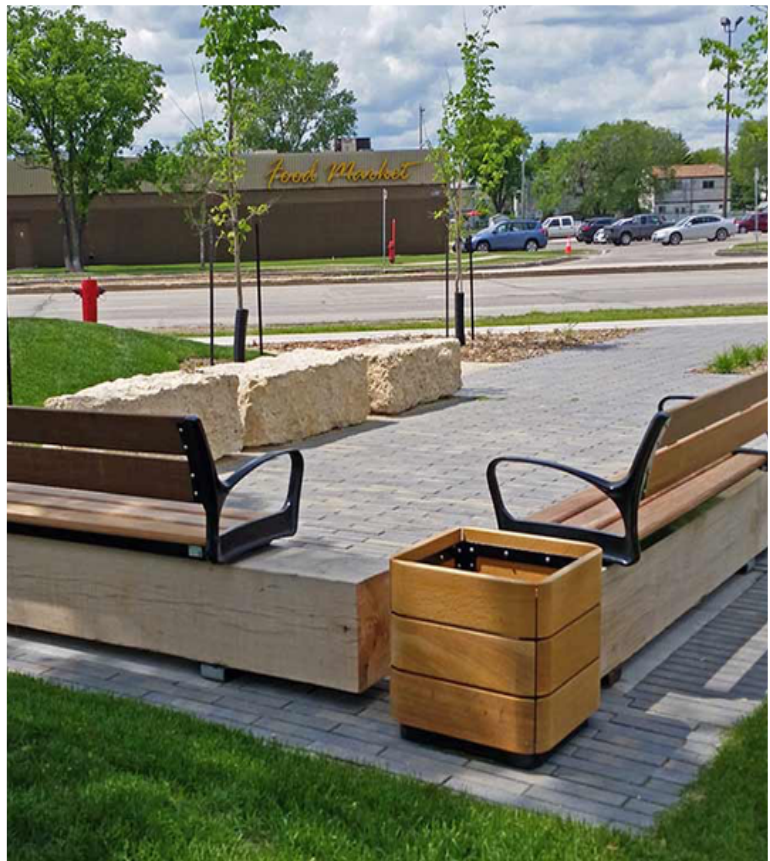
Example of a seating node near a sidewalk.

Add benches or raised seating areas along the outer perimeter of the park next to the sidewalk and in the dog park. This would encourage an eyes-on-the-street environment. It also encourages the use of the park as a meeting spot. In addition, many students from Washington Middle School use the corner across the park on the southwest corner of 10th & Park to hang out and wait for parents to pick them up. They appear to choose that location rather than the park because there are low walls on that corner for sitting and chatting together. There is also a hard surface for skateboarding. It is also highly visible from the street and thus safer.