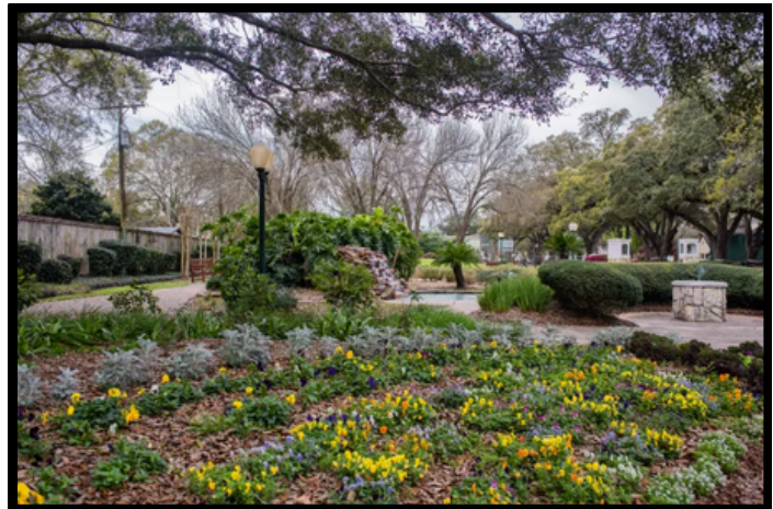
A small flower garden in League City, TX