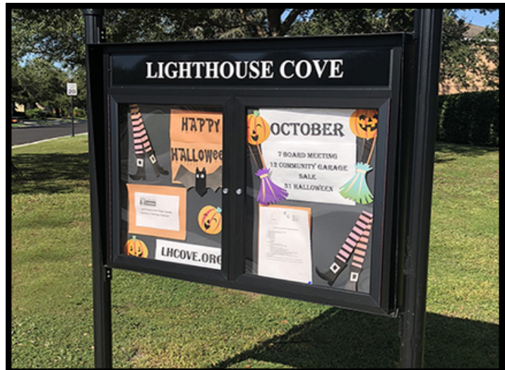
Example of a new bulletin board.