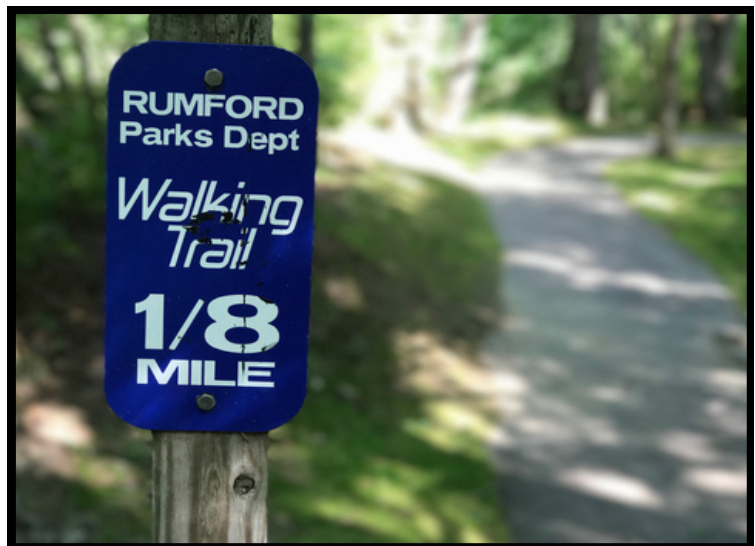
Distance markers on a walking trail.

A walking path would encourage use of the park at many times during the day, including morning, noon, and evening. A path would also circulate people through much of the park, thus maintaining more activity throughout the park, and more eyes on the park. Lighting of the path would encourage use even after dark during the winter and provide lighting throughout the park. Marking distances on the path would encourage people who want to walk a certain distance each time.