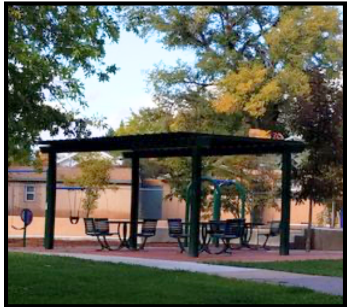
A shade structure at Mary Fox Park.

A billboard for posting neighborhood news would enhance communication between neighbors and increase general neighborhood activities. Our current neighborhood sign, which is across the street, is a closed, locked box and thus cannot be used for posting events by members of the neighborhood. We recommend a neighborhood-style bulletin board for posting papers and posters.