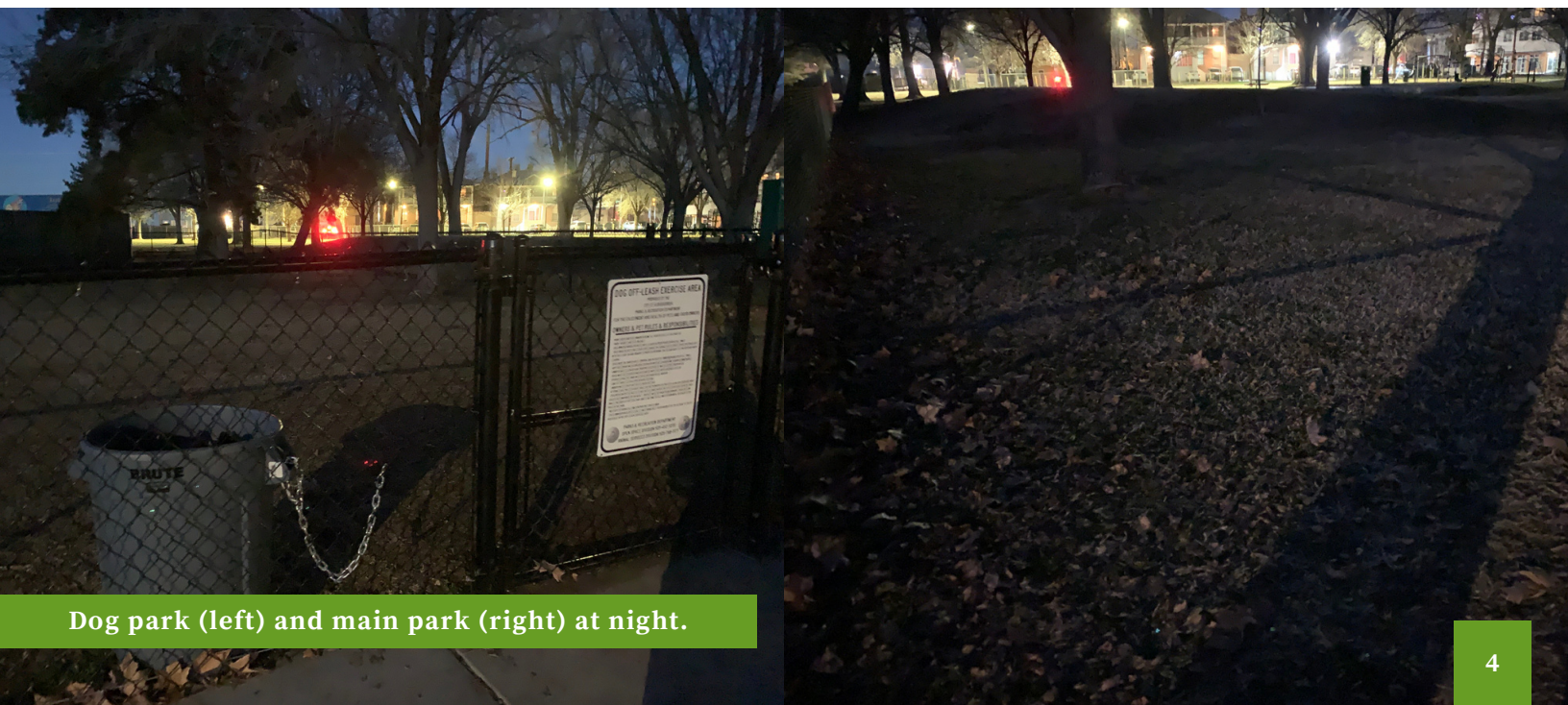
Dog park (left) and main park (right) at night.